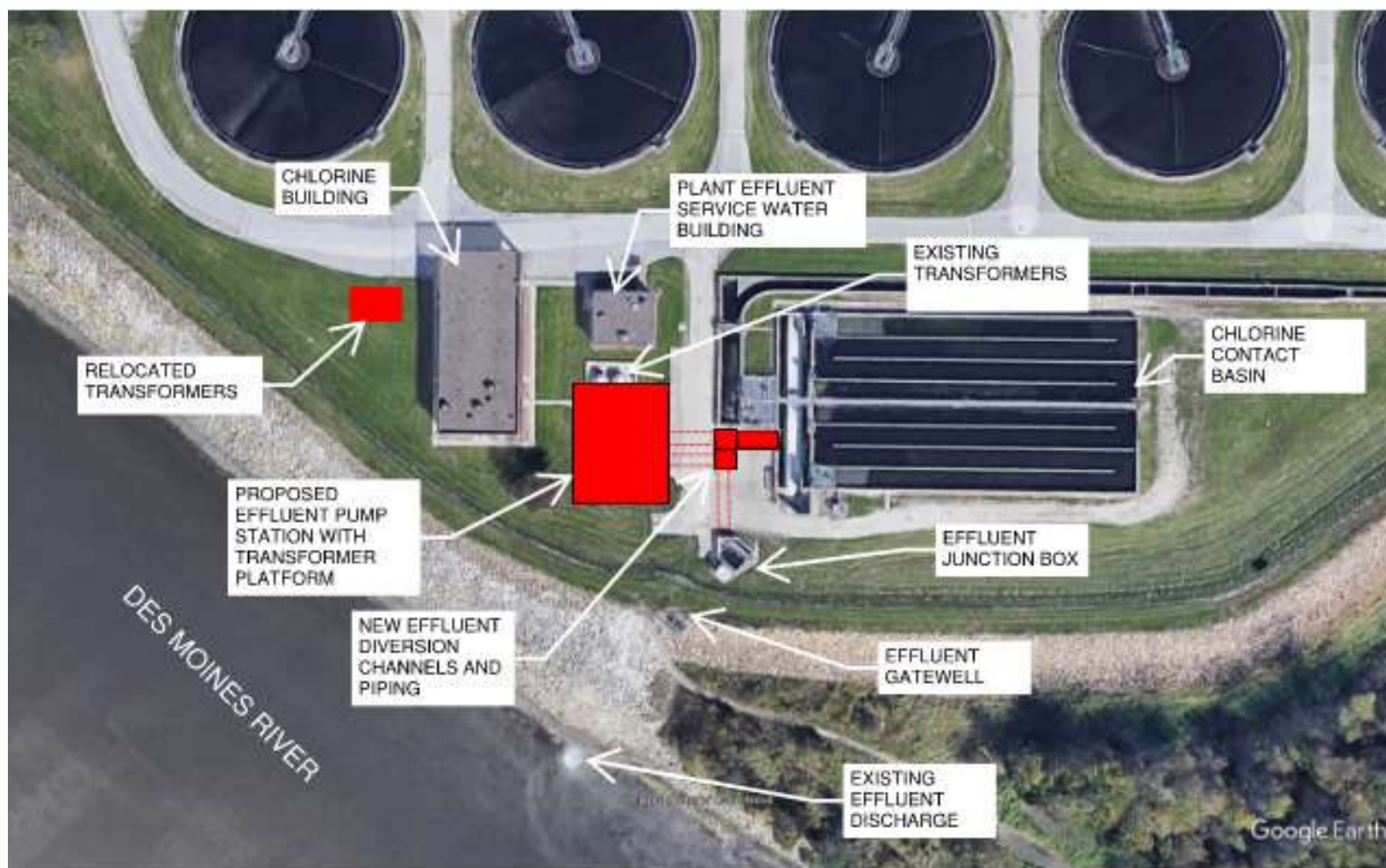
Figure 2. Project Site Map